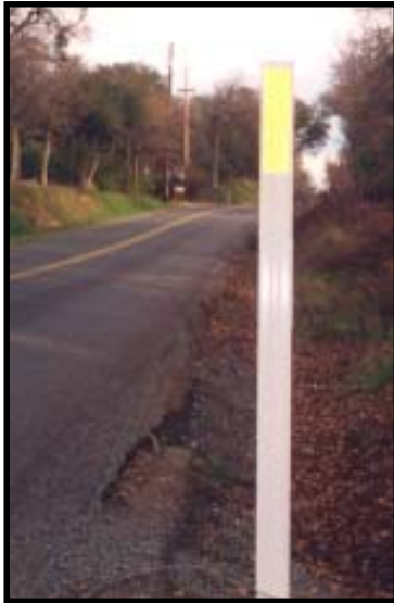
Day & Night Visibility